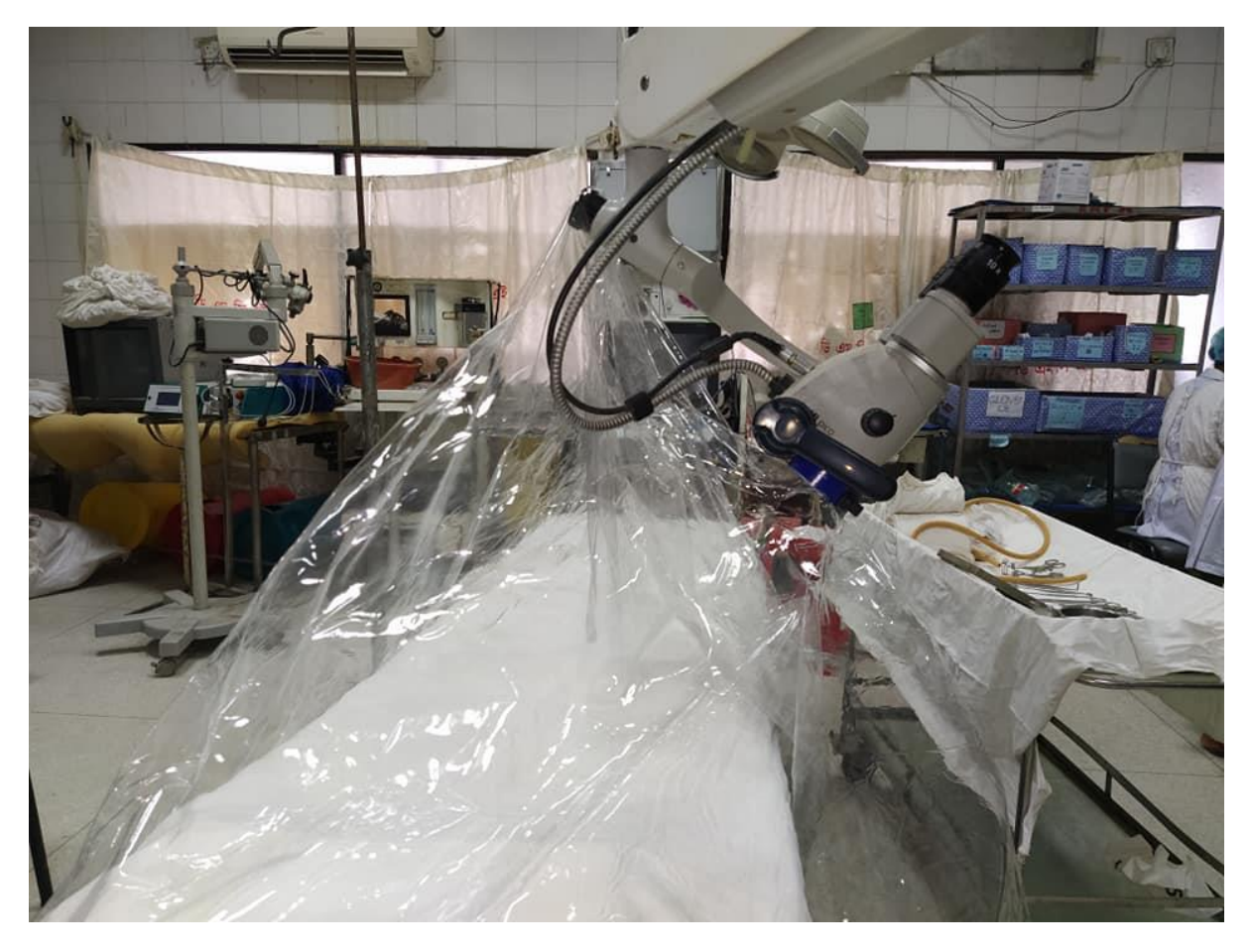
Figure: Polythene is fixed with Objective Lens and another point by creating hole in this polythene sheet and fixing it with micropore