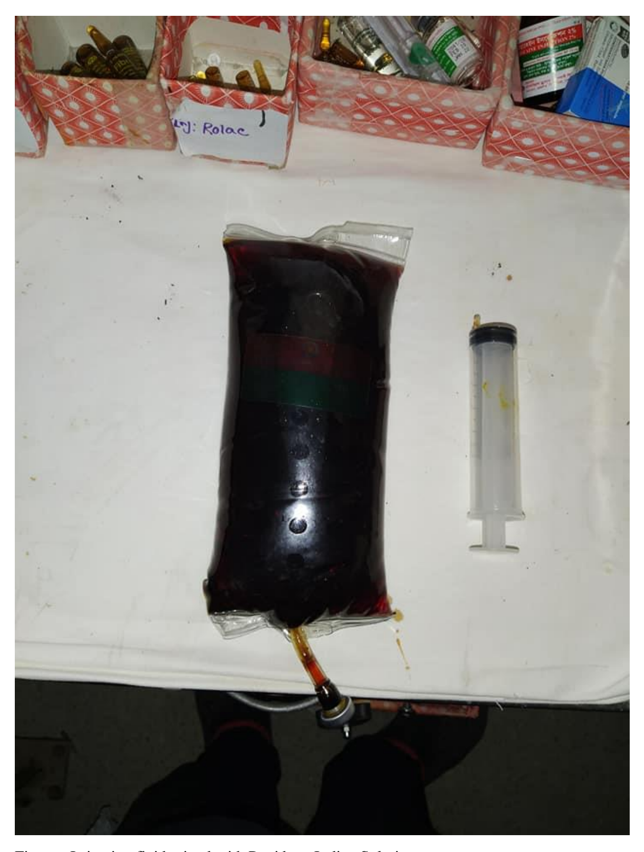
Figure: Irrigating fluid mixed with Povidone Iodine Solution