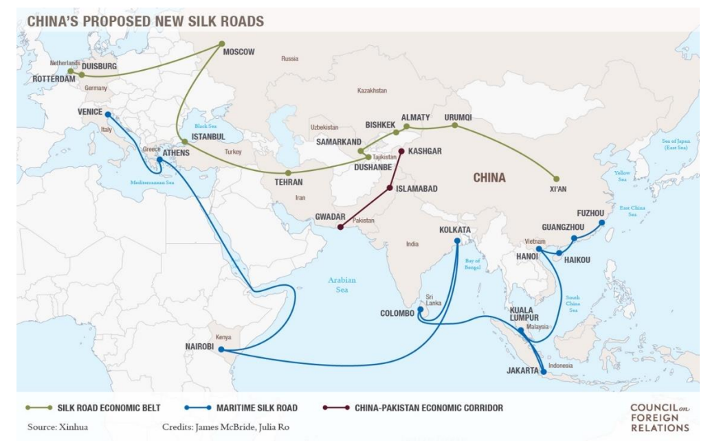
Figure. 2 CPEC in the framework of OBOR.

CPEC is situated at the junction of Silk Road Economic Belt and Maritime Silk Road. The core construction of CPEC is planned to be along the Karakoram Highway which was built the 1970s. Karakoram highway connects the border of China with Pakistan and thus it is considered to be the prime and ideal location for this project. This study is based on the evaluation of the economic development of CPEC on the local development of Pakistani society. The CPEC, a multi-billion US dollars development plan, is heralded as a 'game changer' for Pakistan's economic and regional development. Being an essential portion of a main development initiative organized by China, known as 'Belt and Road Initiative' (BRI), to link Asia with Europe, Middle East, and Africa, the CPEC is much linked to interests and hopes, , as well as global geopolitics and regional development (see Fig. 2). However, such major development never come without critical questions and challenges (Ibrar et al., 2016b, Ibrar et al., 2018f).