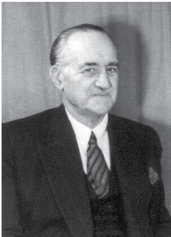
M. A. Rasulzadeh. Ankara. 1950

or preferred to keep silent about certain facts in the name of "national unity" or in order to idealize a historical personality. The fight of those days, projected onto our time under different angles, is the cause of dispute between supporters of, for example, N. Narimanov and M. Rasulzadeh; usually the latter sharply attack, while the