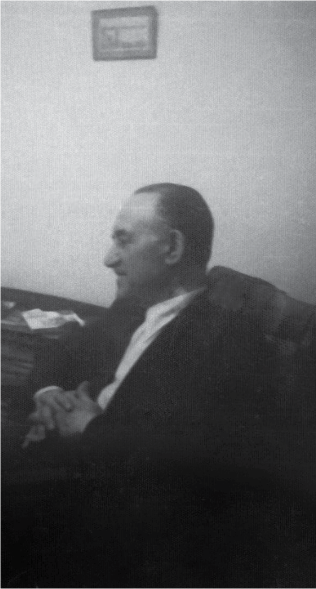
M.A. Rasulzadeh. Ankara. 1950

journalistic works primarily of immigrants from Russia - Yusuf Akchura, Ali Bay Huseynzadeh and A. Agaoglu and representatives of Turkish political thought - Ziya Gokalp. Thus, a descendant of the Volga Tatars, Yusif Akchura, put forward the slogan of "Ottomanism, Islamism and Turkism" in 1904. Back in 1905-1906, Huseynzadeh formulated the basic provisions of political Turkism and Turanism and put forward his famous slogan "Turkify, Islamize, Europeanize". Rasulzadeh was the youngest of this cohort of politicians and ideologues, from whom he learned. He published the work "Iranian Turks" in Turk Yurdu journal.