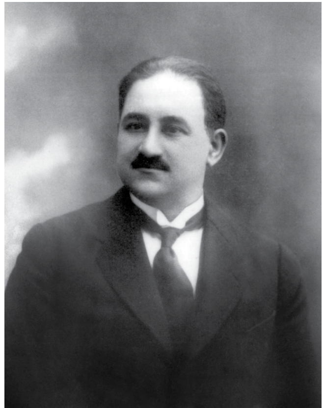
M.A. Rasulzadeh, 1919

The February Revolution of 1917 in Russia deepened political confrontation in the country and led to the intensification of the struggle for power. The congress of Muslims of the Caucasus held in such conditions in Baku on 15-20 April and the Congress of Russian Muslims held in Moscow on 1-11 May spoke out in favor of the idea of building a new Russian state on the principle of territorial autonomies, which was actively promoted by Rasulzadeh. Thus, Rasulzadeh, along with Topchubashov, became a leader of the movement for territorial autonomy. During this period, all political forces in Russia, except the Bolsheviks, defended the unitary model of the Russian state. Thus, the situation prompted cooperation with the Bolsheviks, who had included a provision on the