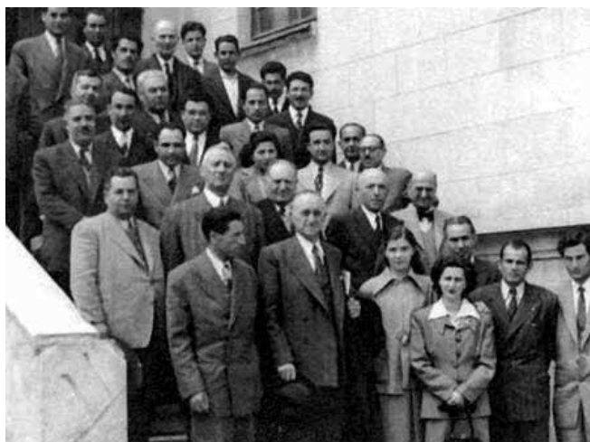
M. A. Rasulzadeh. Ankara. 1950

former defend themselves and launch a counterattack only in some cases. To get closer to the truth from which it is almost never possible to remove its mysterious and misty veil, it is necessary to abandon the idea of creating idols and conduct systematic and long-term studies.