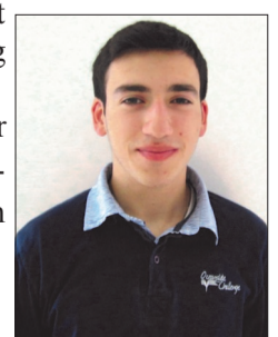
By Emin FATTAHZADE , School of Humanities and Social Sciences

Finally, I can say that sports and exercise help not only for your health but also it helps to spend your free time with exciting and interesting activities with others and no one can imagine life without sport.