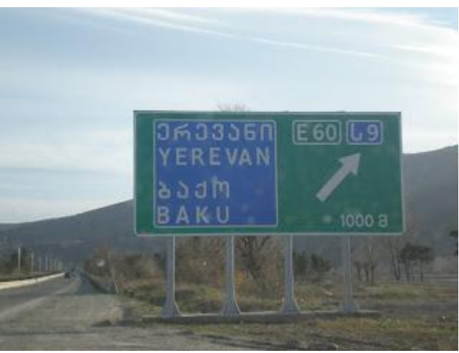
Europe or Asia?

Another important question is whether Georgia can be defined as a European country. 54% of Georgians agree with the statement that "I am Georgian and therefore I am European" (CRRC's 2009 EU survey) However, there is still tension around defining Georgia as a European country, not least because of its location east of Turkey. Vallery Giscard d'Estaing mentioned that Turkey is a non European state because its capital lies in Asia and 95% of its population lives outside of Europe. If Ankara is in Asia, then how is possible to recognize Tbilisi as a European capital when it lies further to the East? It is difficult to speak about the prospect of EU integration in the South Caucasus without the integration of Turkey. It might be unrealistic to expect a map of the EU in which there is a huge gap for Turkey and the inclusion of a small Caucasian country. This may be one reason why 52% of Georgians think Turkey should become a member of the EU (CRRC's 2009 EU survey).